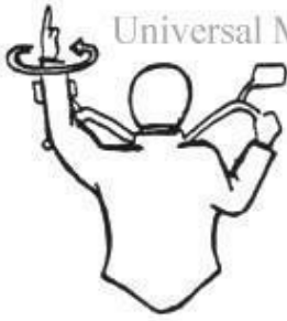
Start your engines

Universal Motorcycle Hand Signals Chart, prepared by MWsbike.com