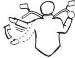
Go ahead and pass me