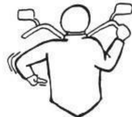
Time for a pit stop