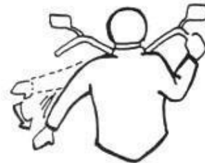
Don't pass me