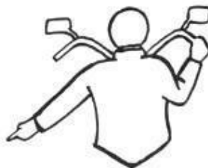
Hazards on the road