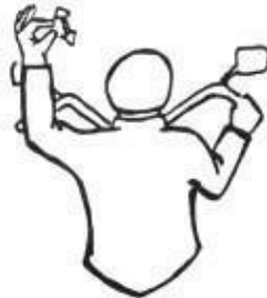
Turn off your turn signals