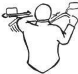
Stop your engines